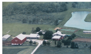
BEAUTIFUL - PRIVATE 103 ACRE FARM $859,000