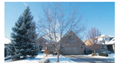
OVER 3,000 SQ FT OF LIVING SPACE $304,900