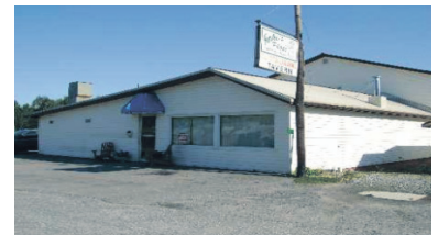
WELL ESTABLISHED RESTAURANT $499,900