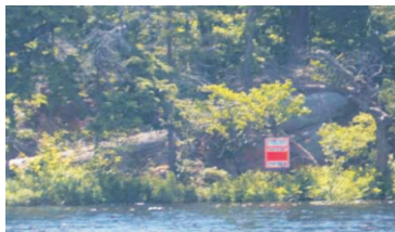
OWN A PIECE OF PARADISE $129,000