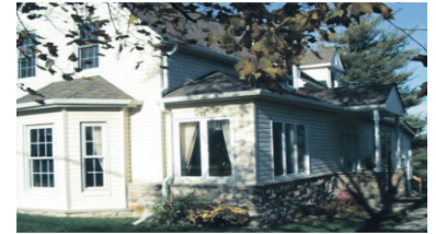
FANTASTIC OLDER HOME ALL MODERNIZED $579,000