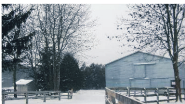
SUPERB INCOME PROPERTY $1,145,000