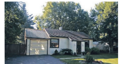
LOVELY BUNGALOW ON TRANQUIL STREET $268,900