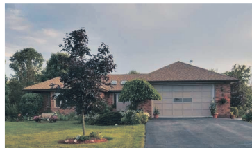
STUNNING HOME ON 1.5 LUSH ACRES! $589,900