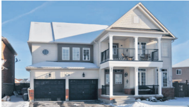
HUGE POOL SIZED LOT $625,000