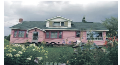
6 BR COTTAGE OVERLOOKING WILSON LAKE $149,000