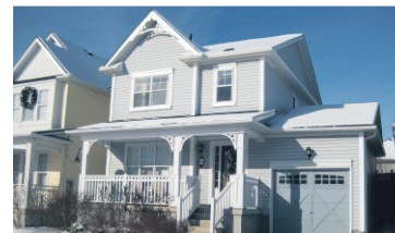
SEE VIRTUAL TOUR! $318,500