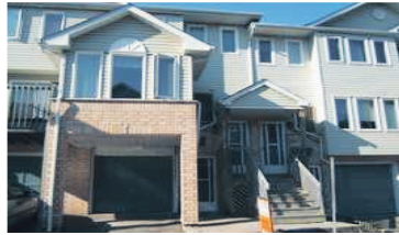
MOVE-IN READY TO ENJOY! $229,000