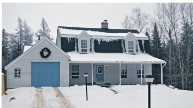
PEACE & TRANQUILITY! $418,888