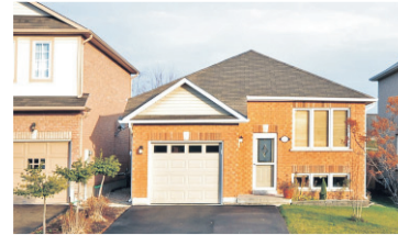
ABSOLUTELY STUNNING BUNGALOW! $359,900