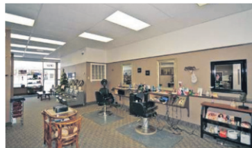
WELL ESTABLISHED BUSINESS-PRIME LOCATION $95,000