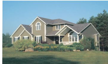
FABULOUS 4 BDRM ABUTTING CONSERVATION $669,900