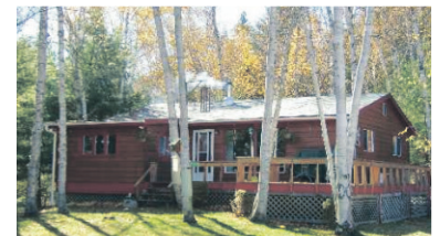
BEAUTIFUL COTTAGE SETTING $299,000