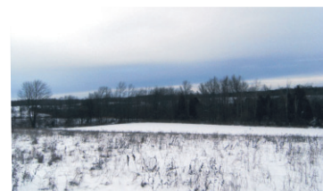
SUPERB 3 ACRE PROPERTY $250,000