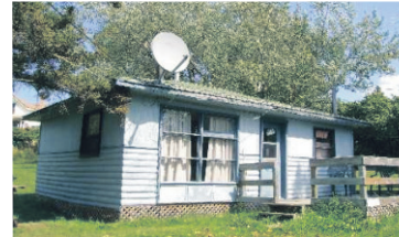
EXCELLENT VIEW OF WILSON LAKE $59,000