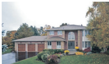
EXCEPTIONAL EXECUTIVE $849,900