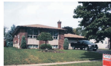
SOMETHING FOR EVERYONE $375,000