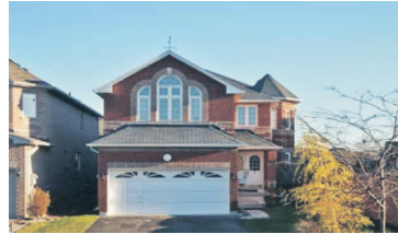
VIRTUAL TOUR @ www.willsell.ca $519,000