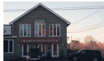
BRIGHT, SPACIOUS 2 BDRM APARTMENT $1,350/Month