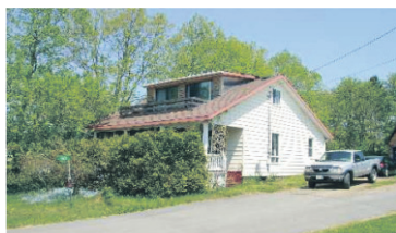
2 BEDROOM IN PORT LORING $138,000