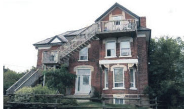
STOP RENTING & START BUILDING EQUITY $149,900