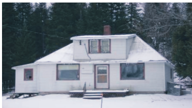
3 BDRM COTTAGE ON 12.73 ACRES $84,900