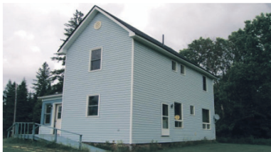
3 BEDROOM IN LORING, ONTARIO $99,000