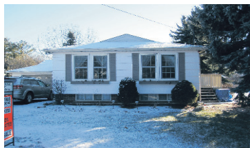
NO NEIGHBOURS BESIDE OR BEHIND! $424,900