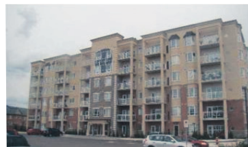
STUNNING 2 BEDROOM CONDO $284,900