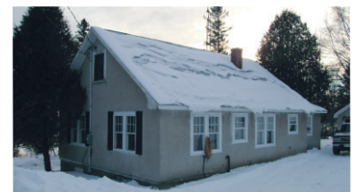
OVERLOOKS WILSON LAKE - PORT LORING $124,000