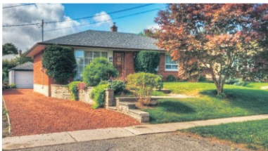
BEAUTIFULLY MAINTAINED - ONE OWNER $329,900