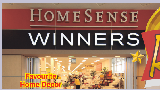
Favourite Home Decor