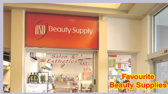
Favourite Beauty Supplies