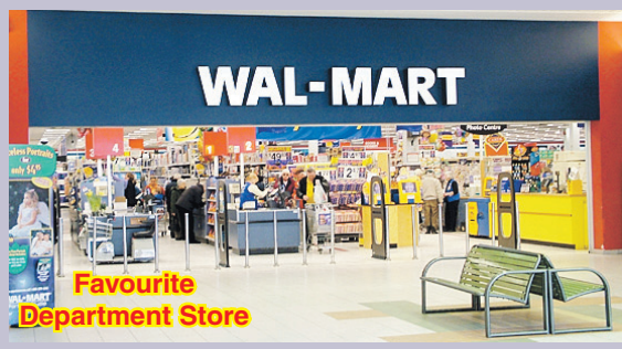
Favourite Department Store