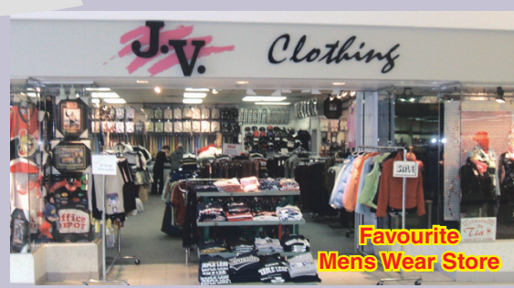
Favourite Mens Wear Store