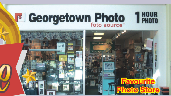
Favourite Photo Store