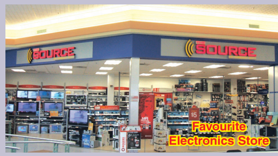
Favourite Electronics Store