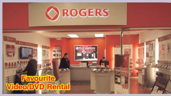
Favourite Video/DVD Rental