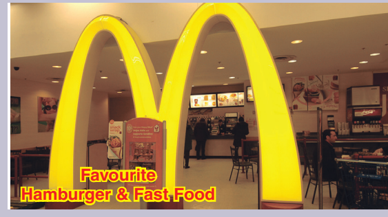
Favourite Hamburger & Fast Food