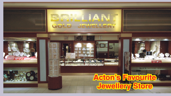
Acton's Favourite Jewellery Store

congratulations to all our winners in the 2011 Readers' Choice Awards.