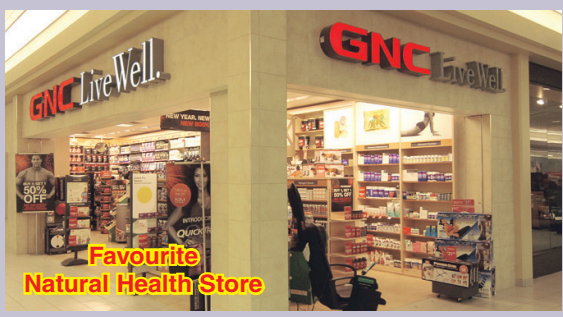
Favourite Natural Health Store