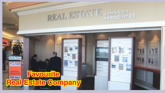
Favourite Real Estate Company