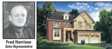
Fred Harrison Sales Representative

2 - 1 bedroom units only $209,900 features large living/dining combo, 2 washrooms, nice size kitchen, stainless steel appliances, stackable washer/dryer. 2 - 2 bedroom units from 289,900-$299,900 features 5 appliances, indoor underground parking, dark laminate in living/dining, 2 washroom, full size eat in kitchen, For more details contact Fred Harrison 905-454-1100.