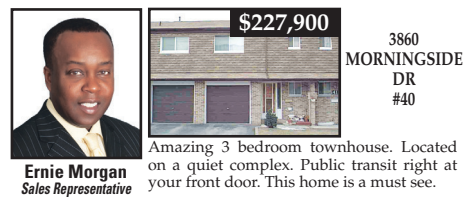
Ernie Morgan Sales Representative

2+1 bedroom detached on a small lot, close to schools, dining and shopping. Kitchen with W/O to patio. Living room with fireplace. Finished basement.