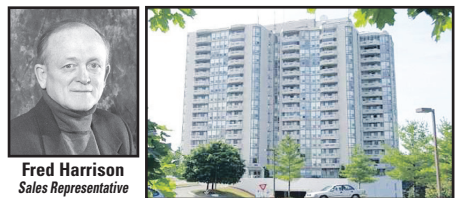
Fred Harrison Sales Representative

Gorgeous Custom built bungalow (approx 3400 S.F.) on a beautiful professionally landscaped 1.04 acre lot located in a prestigious estate subdivision only 25 min. north of Brampton. Features 4 spacious bdrms with hardwood flrs thru-out. Luxurious gourmet kitchen w/upgrd cherry cabinets, granite countertops & marble tile flrs. Open concept F/R w/3 sided gas F/P. Soaring 9ft vaulted ceilings, pot lights + crown moulding, MBK w/2 w/1 closets, Jacuzzi tub + sep x-large glass shower. Formal L/R, Main flr laundry w/access to 3 car garage. Prof. fin bsmt w/sep ent, above grade windows, r/l kitch, ofc with b/l shelves. 5th bdrm w/berber carpet, oak bar, rec room w/berber carpet, gas f/p. Too many extras to mention. View it at www.teampuzo.ca or Call Tony or Adriana Puzo to book a viewing 905-454-1100.