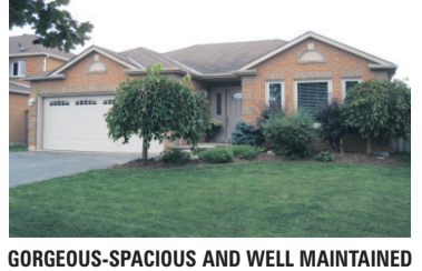
GORGEOUS-SPACIOUS AND WELL MAINTAINED $419,900 11-019-90 W2021683 haltonhomes.com