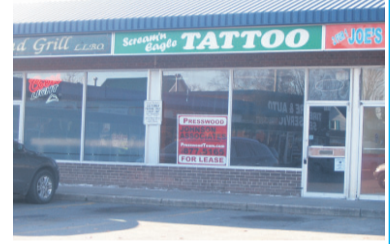
PRIME RETAIL IN BUSY PLAZA $15.00/Sq Ft 10-479-30 W2004918 PresswoodTeam.com