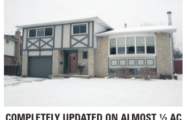
COMPLETELY UPDATED ON ALMOST 1/2 AC $399,000 11-010-90 W1994646 haltonhomes.com