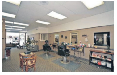
WELL ESTABLISHED BUSINESS $95,000 10-484-30 W2007729 briansnow.org