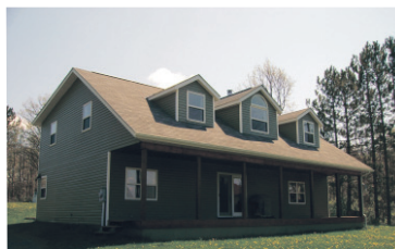
COMPLETELY REFRUBISHED 4 BDRM $329,000