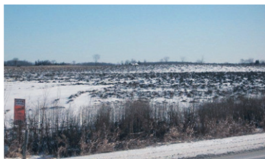
ENJOY THE VIEWS - SUPERB LOCATION $269,000