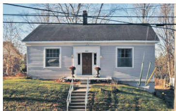
GORGEOUS CENTURY HOME ON HUGE LOT $259,000