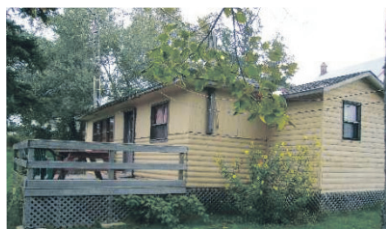
3 BEDROOM COTTAGE $69,000