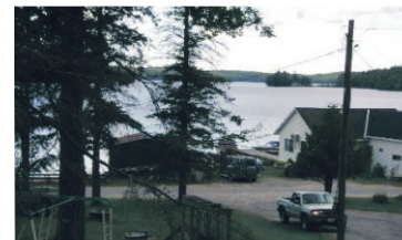
EXCELLENT VIEW OF WILSON LAKE $39,000