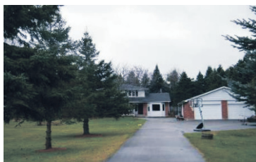
PEACEFUL DREAMING $475,000