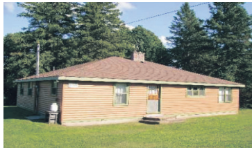
COTTAGE ON LAKE MEMESAGAMESING $349,000