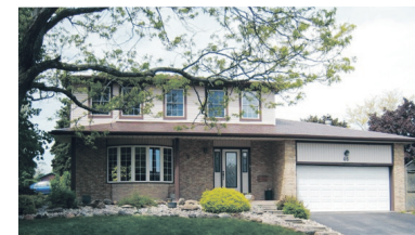
SPACIOUS FAMILY HOME $450,000