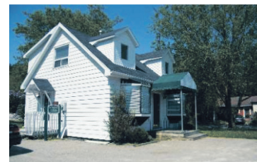
GREAT EXPOSURE FOR YOUR BUSINESS $324,800