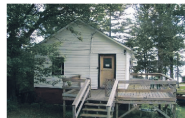
3 BEDROOM COTTAGE $69,000