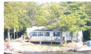
ENJOY THE SUNSETS FROM YOUR DECK $174,900