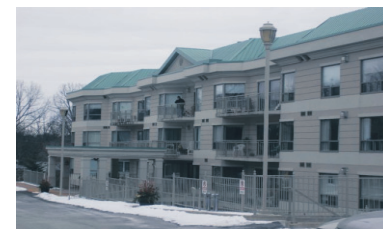
VICTORIA GARDENS PENTHOUSE UNIT $429,000