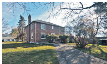
UNIQUE PROPERTY ON 2 LOTS!! $499,000