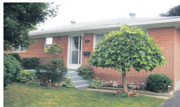
SOLID 2+1 BDRM BUNGALOW! $306,888