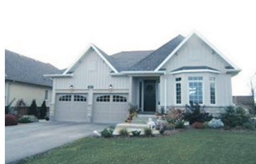
EXECUTIVE BUNGALOW IN MINT CONDITION $559,900