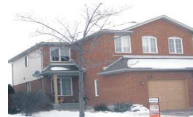
4 BEDROOM ON FAMILY FRIENDLY STREET $344,900