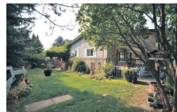
VERY UNIQUE PROPERTY $599,000