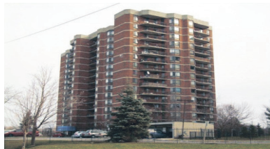
SPACIOUS UPGRADED UNIT O/LOOKS RAVINE $94,900