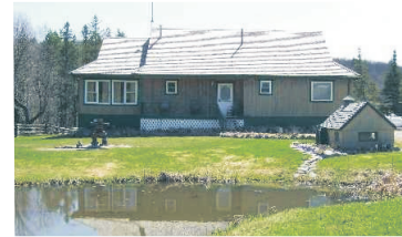
2 + 2 BDRM + WORKSHOP $199,000