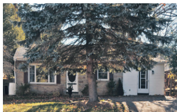
2 BDRM BUNGALOW-www.willsell.ca $284,900