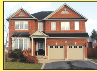
EXQUISITE HOME WITH SHOW STOPPER POOL BACKYARD! $769,900

Absolutely stunning from top to bottom with everything you could ever dream of already done in this family home! In sought after neighbourhood, upgraded EVERYTHING, amazing layout boasting over 3000 sq ft of luxury with an equally well-done finished basement that may have your friends and family overstaying their welcome! Private resort backyard, landscaping out of this world that you have to see to believe! Call us for the exclusive details!