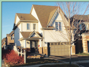
DOUBLE CAR GARAGE WITH 4 BEDROOMS IN STEWART'S MILL $449,900

OUR FAMILY TAKING CARE OF YOUR FAMILY SINCE 1978 AND LOVING IT!