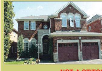
NOT A STITCH OF CARPET IN STEWART'S MILL $599,900

This gorgeous home is beautifully decorated in neutral tones & loaded with upgrades. Includes 9' ceilings on main floor, hardwood floors thruout, upgraded kitchen & bathrooms, custom mantle around gas fireplace in family room & an impressive palladian window in front hall. Upgraded oak staircase leads to master retreat featuring a luxurious 6 pc ensuite & a massive WI closet. Bright prof finished basement boasts a wet bar, wainscotting & lots of pot lights. Beautifully landscaped with an ornamental pond, French curbs, concrete walkways & aggregate patio. Impeccably maintained - nothing to do but enjoy.