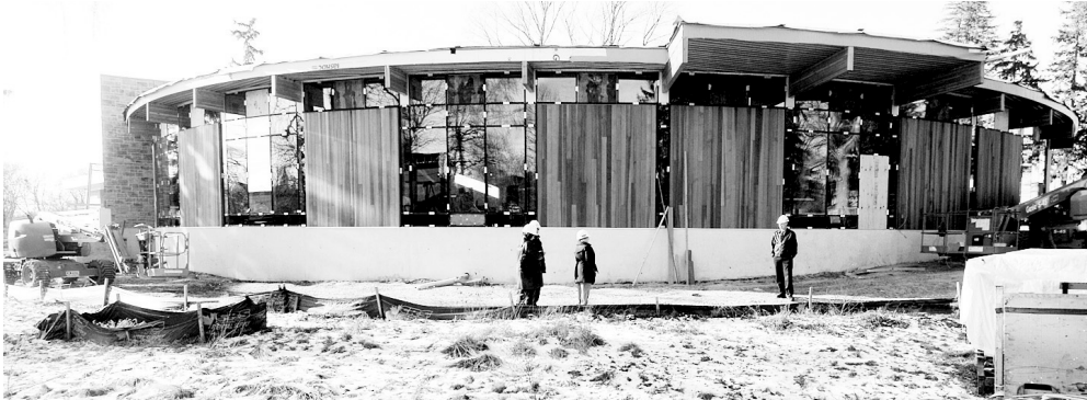
Acton library taking shape