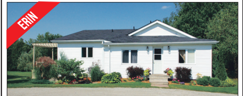
THIS ONE'S A CHARMER! MOVE-IN READY, JUST PACK & VOILA - YOU'RE HOME! $424,900 3-bed, 2-bath bungalow on 2 acres of rolling countryside. Easy commute to the GTA yet nature abounds. Enjoy a slice of country right in your own back yard!