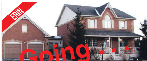
$497,500 4 bdrm brick home, open and bright, located in a great family neighbourhood. This executive home is beautifully landscaped...hot tub to enjoy in your huge fully fenced back yard. The property is 0.52 acre and walking distance to Erin Village. www.al-liz.com