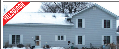
BRING YOUR HAMMER & NAILS AND YOUR IMAGINATION $320,000 2 kitchens, 3 washrooms, 5 bedrooms, hardwood flrs., main floor laundry...and most of this house is only 9 yrs. old. Septic system, roof, windows, furnace, electrical, plumbing (all the expensive stuff is done). With your finishing work you will have a real gem on a great piece of property, nearly 1 acre.