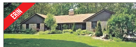
WHAT MORE COULD YOU WANT, WHEN YOU'VE GOT EVERYTHING RIGHT HERE? - $849,000 Gorgeous country estate on 5 acres, $$ spent on upgrades! 4 bdrms, 2.5 baths, solarium, family rm, sun rm, main flr. laundry, finished bsmt with rec & games rms., large det. heated workshop. www.al-liz.com