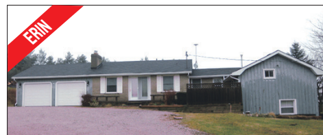
WHERE ELSE COULD YOU FIND... a 4 bdrm, 2 bath detached home on 1/2 acre in the country, yet close to Downtown Erin, for such an affordable price?! $419,000. www.al-liz.com