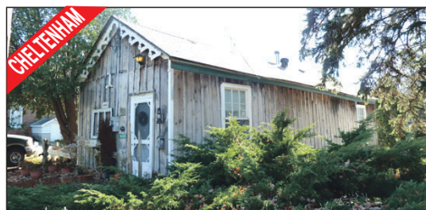
CUTE AS A BUTTON $244,900 Historic 2 bdrm home, backing onto the river right in downtown Cheltenham! Updated kitchen, reproduction windows, hi-efficiency furnace.