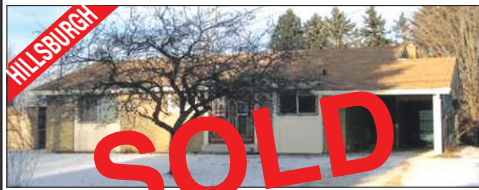
3 BEDROOM BUNGALOW WITH FANTASTIC BACK YARD $279,000 Overlooking protected lands on quiet street in great family neighbourhood in proximity to downtown Hillsburgh. Perfect starter home for the young family or easy car home for empty nesters. Newer deck, updated patio door, updated furnace, 6 appliances.