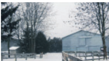
SUPERB INCOME PROPERTY

Kathy Ellis* $1,145,000 10-291-91 W2004618