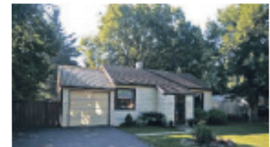
LOVELY BUNGALOW ON TRANQUIL STREET