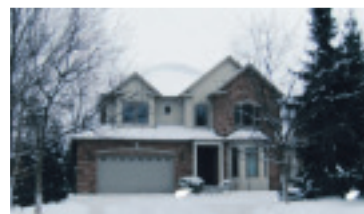
CUSTOM HOME-BACKS ONTO GOLF COURSE

Julia Stuart* $859,000 10-302-99 W1924199