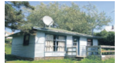
2 BDRM COTTAGE W/VIEWS OF WILSON LAKE

PresswoodTeam.com $375,000 10-362-30 X1953169