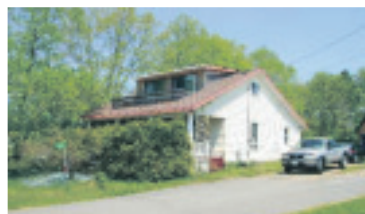
2 BEDROOM IN PORT LORING

Kathy Ellis* $1,145,000 10-291-91 W2004618