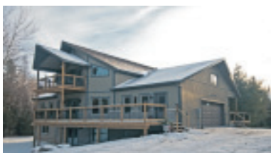
BRAND NEW - SITUATED ON 4.5 ACRES

Bill* & Lia McNally* $1,500/Month 10-432-30 X1983401