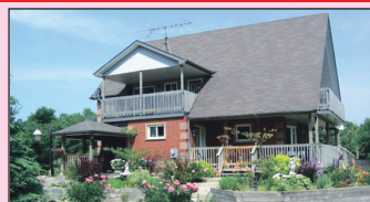
WELCOME HOME TO THIS PARK-LIKE 2.74 ACRES $699,900

Over 3500 square feet of luxury finishes awaits you in this 2 storey masterpiece with oversized triple car garage. The list of features are endless: 4 generous sized bedrooms and 3 full bathrooms on the second floor, 2 gas fireplaces, cathedral ceiling in family room, 9' ceilings on main floor, solid Maple kitchen cabinets & bathroom vanities, granite countertops, main floor den/office/guest room + WALKOUT basement for more living space. Select all your perfect colours and don't look back! Call for the exclusive details!