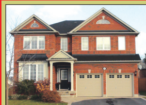
EXQUISITE HOME WITH SHOW STOPPER POOL BACKYARD! $769,900

Beautifully maintained show-piece home with a whopping 3600 sq. ft plus a walkout bsmt awaiting your ideas. Gorgeous patterned concrete balcony & patio plus concrete ballisters and handrails that have a grandiose Tuscan feel - and a wrought iron circular staircase to boot! Prof. landscaped with a concrete driveway that sets this house apart with its amazing curb appeal. Pride of ownership inside & out...plaster crown mouldings, custom trim and baseboards, 9' ceilings on main flr, french doors, hrdwd flrs & stylish ceramics throughout. California shutters, solid staircase. Excellent layout on every floor with amazing square rooms! Professionally painted top to bottom, master bdrm retreat with a 5pc bthrm out of Trump Tower that you have to see!