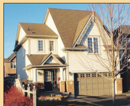
DOUBLE CAR GARAGE WITH 4 BEDROOMS IN STEWART'S MILL $449,900

Lovely open concept plan featuring interior garage access, country size eat-in kit. with large centre island open to living/dining room with gorgeous hrdwd flooring. Views to amazing fully fenced yard with stunning interlock patio and front walkway. Upstairs . . . 4 good sized bdrms including large sunken room at the front of the house right out of a designer magazine, 2 large washrooms including main bath with water closet so more than one user at a time, ample closet space & more. Call to view before it's gone.