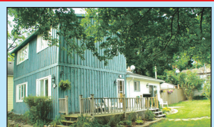
CHARMING CENTURY HOME WITH ALL THE FIXINS! $319,900

Stunning, all brick, custom home featuring a modern open concept design & a unique blend of elegance & country charm. Beautifully decorated & recently improved with richly stained walnut floors, ceramics & lovely new trim & baseboards. Impressive great room with floor-to-cathedral ceiling brick fireplace. Full 1 bdrm inlaw suite beautifully done with games room, living room with stone fireplace and lots of pot lights. Detached dbl car garage plus a fantastic workshop (30'x55') with heat, hydro, water, 14' ceiling, 2 truck doors & mezzanine. Great location - just 20 min. to Georgetown GO. Call for full details.