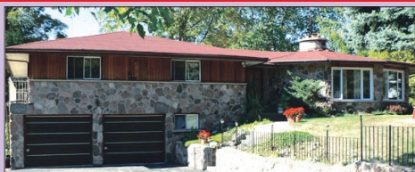
ALMOST ONE ACRE, 4 BEDROOM BUNGALOW, EDGE OF TOWN $619,900

Lovely open concept plan featuring interior garage access, country size eat-in kit. with large centre island open to living/dining room with gorgeous hrdwd flooring. Views to amazing fully fenced yard with stunning interlock patio and front walkway. Upstairs . . . 4 good sized bdrms including large sunken room at the front of the house right out of a designer magazine, 2 large washrooms including main bath with water closet so more than one user at a time, ample closet space & more. Call to view before it's gone.