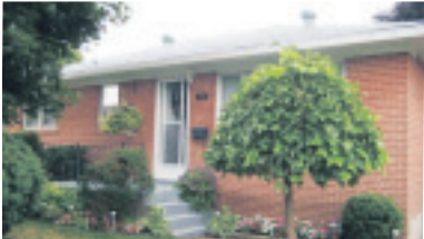
SOLID BRICK BUNGALOW "REAL CUTIE"

Dianne Penrice** $579,000 10-408-30 W1972993