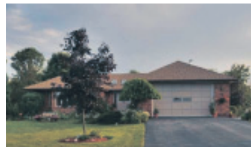
STUNNING HOME ON 1.5 LUSH ACRES!

Bill* & Lia McNally* $589,900 10-289-99 W2003639