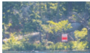
WATERFRONT LOT ON SEAGULL LAKE