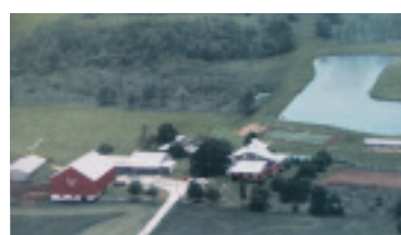
BEAUTIFUL - PRIVATE 103 ACRE FARM

Julia Stuart* $859,000 10-302-99 W1924199