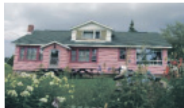
6 BDRM OVERLOOKING WILSON LAKE