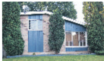
PARK & HOT TUB IN BACKYARD!

haltonhomes.com $549,900 10-388-30 W1986824