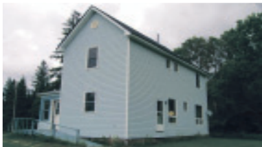
3 BEDROOM IN LORING, ONTARIO

Marilyn Kerr* $268,900 10-326-91 X1997033