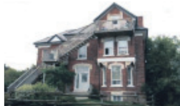
STOP RENTING & START BUILDING EQUITY

Brenda MacDonald* $306,888 10-314-30 W1932068