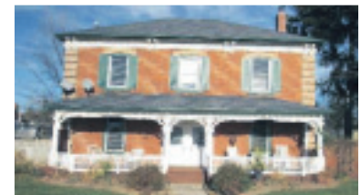
COMPLETELY RENOVATED CENTURY HOME

haltonhomes.com $1,350/Month 10-434-30 X1984348