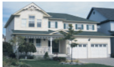
OPEN CONCEPT-WALK TO SCHOOLS & PARKS

Kathy Ellis* $485,000 10-405-30 W1978214