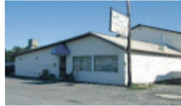
MODERN, WELL ESTABLISHED RESTAURANT

David Burland* $16,500 10-347-60 W1948399