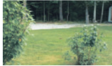
OWN A SHARE OF A PRIVATE PARK

David Burland* $16,500 10-347-60 W1948399