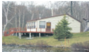
2 BEDROOM COTTAGE ON LEGROUT LAKE

Elizabeth Doell* $329,900 10-355-30 W1999213