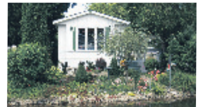
QUAINT WATERFRONT HOME

PresswoodTeam.com $375,000 10-362-30 X1953169