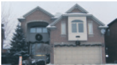
POPULAR 4 BDRM MODEL W/OVERSIZED YARD

Bill* & Lia McNally* $139,000 10-338-99 X1994370