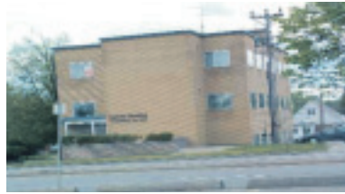
PROFESSIONAL SPACES AVAILABLE

It's easy for you to make good Real Estate decisions backed by your Johnson Associates agent's local knowledge and expertise.