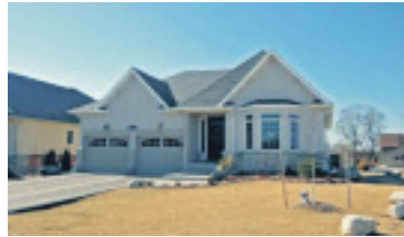
EXECUTIVE BUNGALOW IN PRIVATE ENCLAVE!

PresswoodTeam.com 09-164-30/09/277-30 W2000473/W2004395