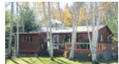
BEAUTIFUL COTTAGE SETTING