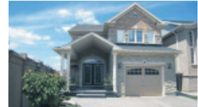
GORGEOUS 2000 SQ FT-GEORGETOWN SOUTH