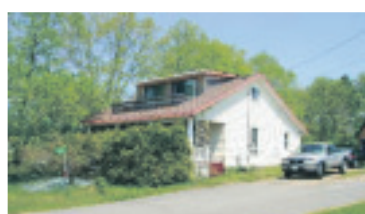
2 BEDROOM IN PORT LORING

Kathy Ellis* $1,145,000 10-291-91 W2004618