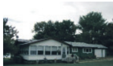
WATERFRONT ON SEAGULL LAKE

Monica Keess* $335,000 10-389-30 W1993471