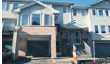
MOVE-IN READY TO ENJOY!

David Burland* $319,000 10-446-90 W1989274