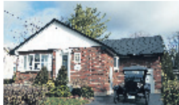
QUIET STREET, BEAUTIFUL YARD!

Bill* & Lia McNally* $149,900 10-335-30 W1989772