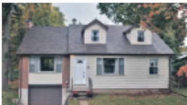
4 BDRMS & DET. GARAGE IN NORVAL

Bill* & Lia McNally* $1,500/Month 10-432-30 W1983401