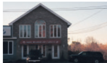
BRIGHT, SPACIOUS 2 BDRM APARTMENT

David Burland* $95,000 09-081-VL W1905508