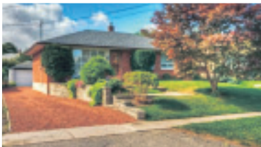
BEAUTIFULLY MAINTAINED - ONE OWNER