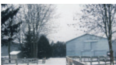
SUPERB INCOME PROPERTY

Kathy Ellis* $1,145,000 10-291-91 W2004618