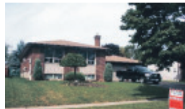
SOMETHING FOR EVERYONE

Bill* & Lia McNally* $249,000 10-402-99 X1969455