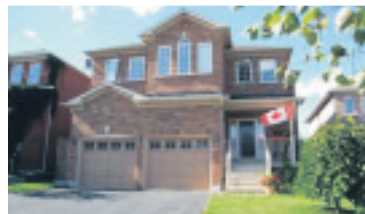
EXCEPTIONAL HOME - SUPERB STREET

Karen McEvoy* $299,900 10-386-30 W1968946