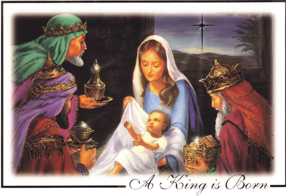
A King is Born

We will not pass along "Season's Greetings" Or wish you "Happy Holidays"; Nor any other "festive slogan" To detract from coming days.