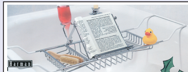
Bath Caddy & Many More Gift Ideas