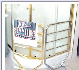
Towel Warmer from $199.99