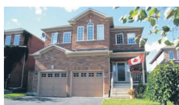
EXCEPTIONAL HOME - SUPERB STREET

Karen McEvoy* $299,900 10-386-30 W1968946