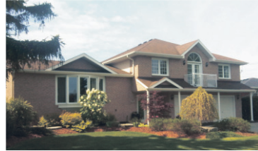
RAVINE LOT ON CUL-DE-SAC

Bill* & Lia McNally* $149,900 10-335-30 W1998772