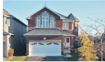
VIRTUAL TOUR AT www.willsell.ca

David Burland* $16,500 10-347-60 W1948399