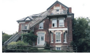
STOP RENTING & START BUILDING EQUITY

Brenda MacDonald* $306,888 10-314-30 W1932068