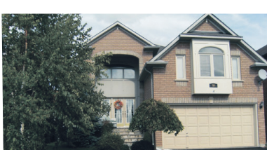
POPULAR 4 BDRM MODEL W/OVERSIZED YARD

Bill* & Lia McNally* $139,000 10-338-99 X1943790