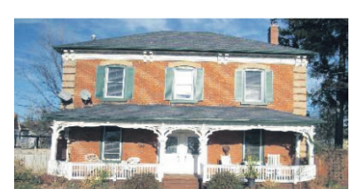
COMPLETELY RENOVATED CENTURY HOME

haltonhomes.com $1,350/Month 10-434-30 W1984348