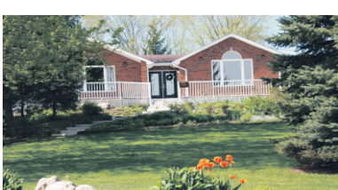
SUPERB INCOME PROPERTY

Monica Keess* $379,900 10-401-30 W1986681