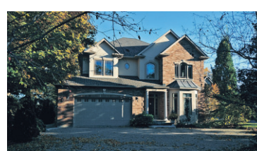
CUSTOM HOME-BACKS ONTO GOLF COURSE

Julia Stuart* $859,000 10-302-99 W1924199