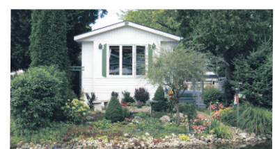
QUAINT WATERFRONT HOME

PresswoodTeam.com $375,000 10-362-30 W1953169