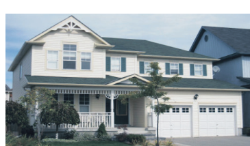
OPEN CONCEPT-WALK TO SCHOOLS & PARKS

Kathy Ellis* $495,000 10-405-30 W1978214