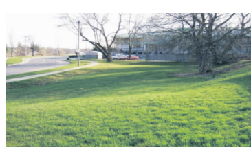
COMMERCIAL LAND ON HIGHWAY #7 & #25

Bill*/Lia McNally* $449,900 10-412-90 W1974410