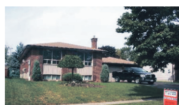
SOMETHING FOR EVERYONE

Bill* & Lia McNally* $249,000 10-402-99 X1969455