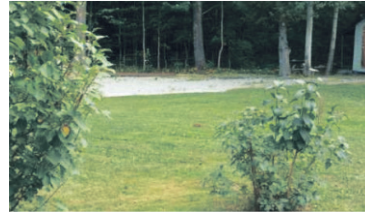
OWN A SHARE OF A PRIVATE PARK

David Burland* $16,500 10-347-60 W1948399