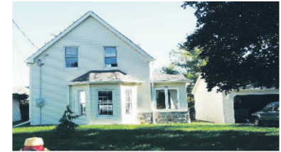
FANTASTIC OLDER HOME ALL MODERNIZED

Bill* & Lia McNally* $519,000 10-457-30 W1992793