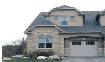
CHARLESTON HOME - PREMIUM LOT!

Elizabeth Doell* $329,900 10-355-30 W1999213