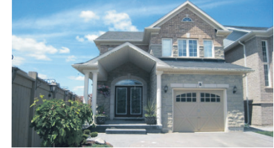
GORGEOUS 2000 SQ FT-GEORGETOWN SOUTH