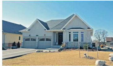
EXECUTIVE BUNGALOW IN PRIVATE ENCLAVE!

PresswoodTeam.com 09-164-30/09/277-30 W2000473/W2004395