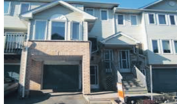
MOVE-IN READY TO ENJOY!