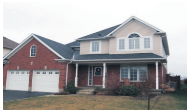
CHARLESTON 4 BDRM - GREAT LAYOUT

Bill*/Lia McNally* $529,900 10-460-91 X1994157