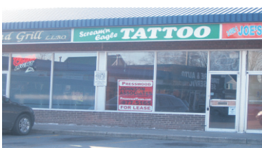
PRIME RETAIL - BUSY PLAZA

Marilyn Kerr* $268,900 10-432-91 X1997033