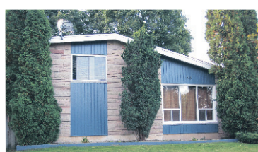
PARK & HOT TUB IN BACKYARD!

haltonhomes.com $549,900 10-388-30 W1986614