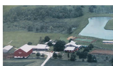
BEAUTIFUL - PRIVATE 103 ACRE FARM

Jill Johnson* $669,900 10-453-91 X1992132