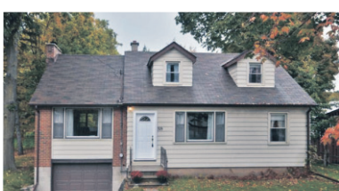
4 BDRMS & DET. GARAGE IN NORVAL

Bill* & Lia McNally* $1,500/Month 10-432-30 W1983401