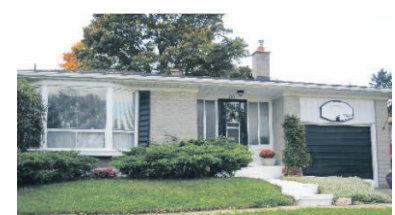
RAVINE LOT - INGROUND POOL - 4 BDRM

PresswoodTeam.com $344,900 10-411-30 W1974418