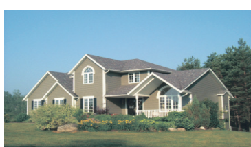
FABULOUS 4 BR ON ABUTTING CONSERVATION

Kathy Ellis* $1,145,000 10-291-91 W2004618