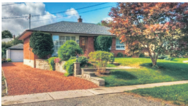
BEAUTIFULLY MAINTAINED - ONE OWNER