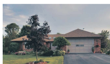
STUNNING HOME ON 1.5 LUSH ACRES!

PresswoodTeam.com $15.00/SQ FT 10-479-30 W2004918