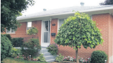
SOLID BRICK BUNGALOW "REAL CUTIE"

Dianne Penrice** $579,000 10-408-30 W1972993