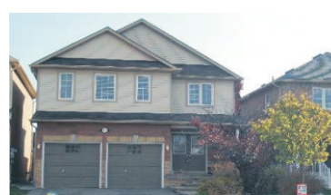
WALKING DISTANCE TO SCHOOLS, PARKS

Monica Keess* $335,000 10-389-30 W1993471