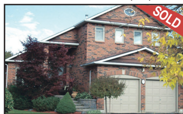
STYLISH GEORGETOWN HOME $535,000