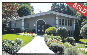
GEORGETOWN PARADISE $1,250,000

Located in Milton's pride development. This 3 year old Mattamy home provides 2045 sq ft that overlooks Burling Park, with views from a private porch and balcony. Many quality features including: Dark solid oak staircase & hardwood flooring; Maple Cabinets; California Shutters throughout; grand plaster mouldings highlighting the modern interior decorator wall colours; Professionally landscaped; private courtyard with interlock patio & trees; Double car garage. Everything is upgraded! Home shows pride of ownership! $538,000 Exclusive Listing. Call for an appointment to view.