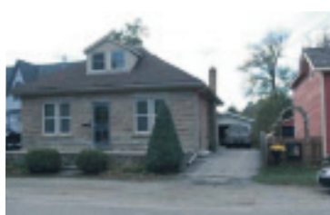
CENTURY HOME BACKING ON CREDIT RIVER $589,000