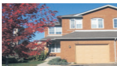
GEORGETOWN SOUTH 4 BDRM SEMI $344,000