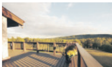
9.8AC ON ESCARPMENT-AMAZING VIEWS $1,595,000