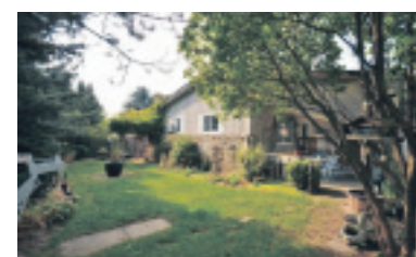
A VERY UNIQUE PROPERTY! $599,900