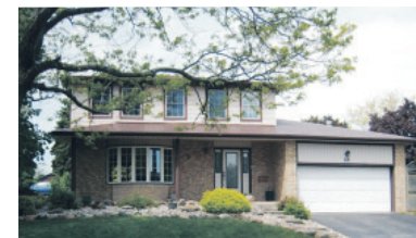
SPACIOUS FAMILY HOME $450,000