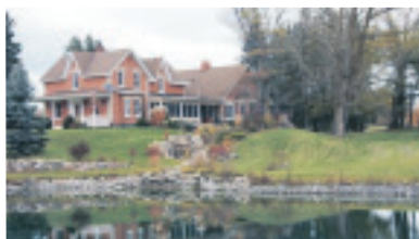
COUNTRY ESTATE WITH 2 PARCELS $3,195,000

Listing details available at: www.johnsonassociates.ca