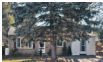
2 BDRM BUNGALOW - www.willsell.ca $284,900