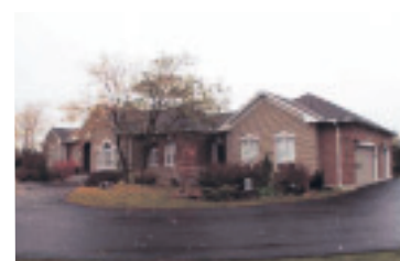
COUNTRY BUNGALOW ON 2 ACRES $769,000