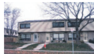
WALKING DISTANCE TO MALL, STORES, SCHOOLS $214,900