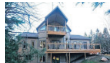
BRAND NEW HOME ON 4.7 ACRES $785,000