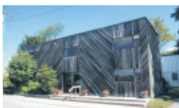
EXCELLENT COMMERCIAL - www.willsell.ca $5,000/Month