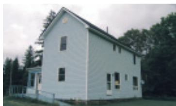
3 BEDROOM IN LORING, ONTARIO $99,000