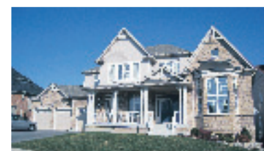
RAVINE IN GLEN WILLIAMS $939,000