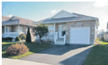
CLEAN & BRIGHT BUNGALOW IN FERGUS $262,200