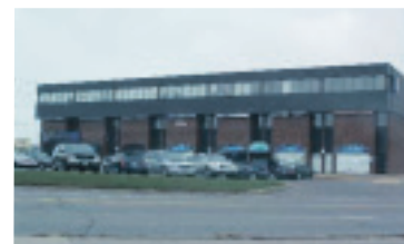
RENTAL UNIT AVAILABLE $13.00/SQ FT