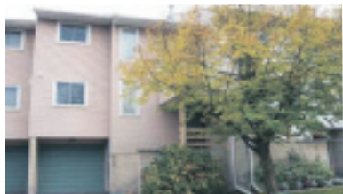
GREAT LOCATION! $259,900

Mary Maan*/Emma Fedor* 10-222-30 W2001500