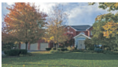
EXCEPTIONAL ELEGANCE IN WILDWOOD ESTATES $1,250,000

Mary Maan*/Emma Fedor* 10-218-30 W2000153