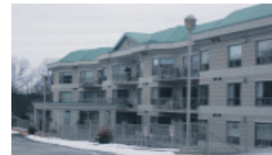
VICTORIA GARDENS PENTHOUSE UNIT $429,000