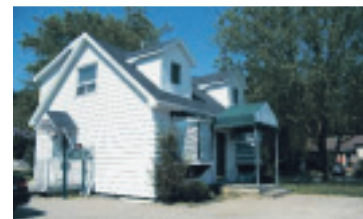
GREAT EXPOSURE FOR YOUR BUSINESS $324,800