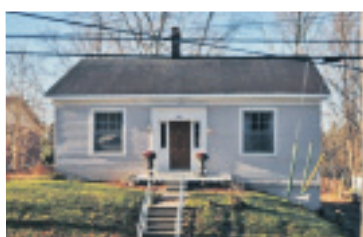
ROCKWOOD CENTURY HOME - www.willsell.ca $259,000