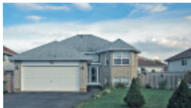
SPARKLING 3+2 BDRM RAISED BUNGALOW $269,900