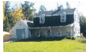
PEACE & TRANQUILITY $418,888