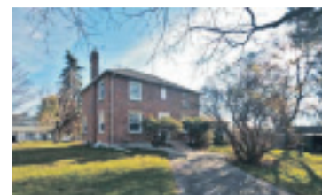
1ST TIME OFFERED IN 40 YRS! DOUBLE LOT! $499,900