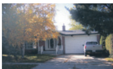
HOME FOR RENT - CLOSE TO SCHOOLS, PARKS $1,775/Month