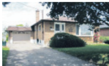
WELL MAINTAINED BUNGALOW $303,000