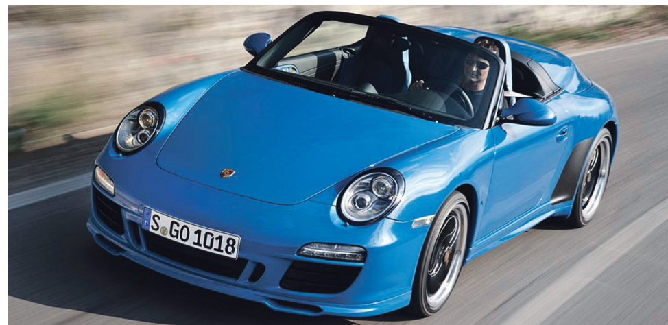
Porsche is showing three cars at this week's LA Auto Show including the 408 hp 911 Speedster.