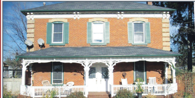
For Lease - $1500 per month + utilities

Shave time off your daily commute! This grand 3800 sq ft home in Brampton has all the bells & whistles. Hardwood, HUGE rooms, finished basement w/bar. 2 tiered deck with hot tub. Sure to impress! willsell.ca