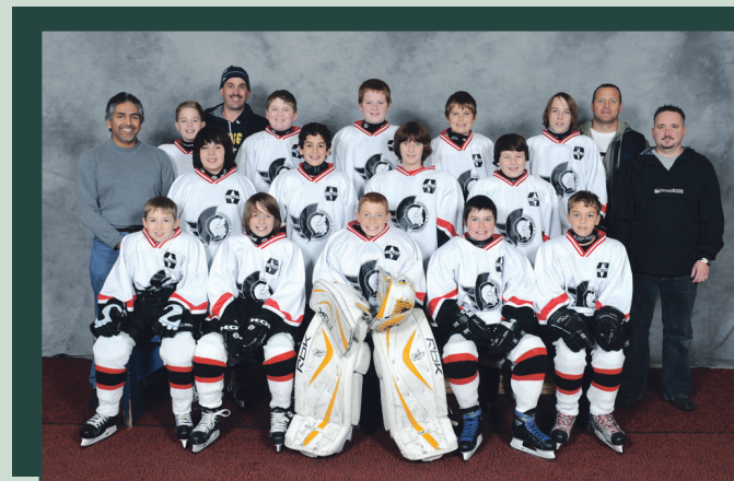
Soler D&V Licensing PeeWee Senators

Only these services are available on the red & white health card: • Organ and tissue donor registration • Change of address • Report cards lost or stolen