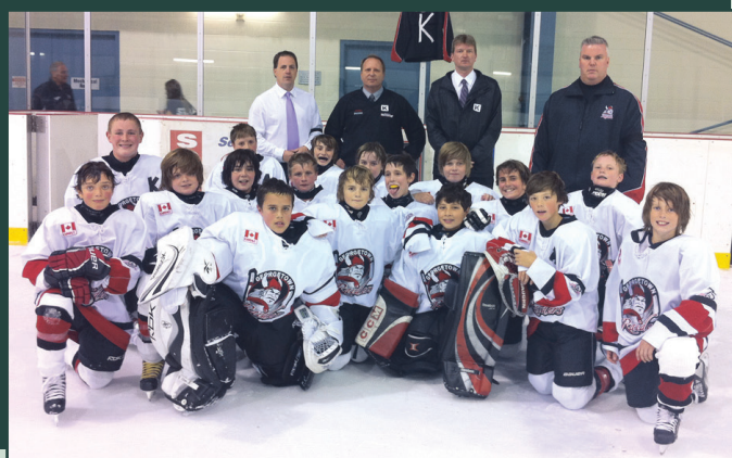
Soler D&V Licensing '98 Selects

The ServiceOntario Georgetown office is proudly operated by Soler D&V Licensing, a family-owned independent contractor under agreement with the Government of Ontario.