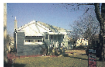
LEGAL 3+2 BDRM DUPLEX $328,500