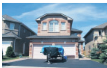
3 BDRM ON QUIET CUL DE SAC $524,900