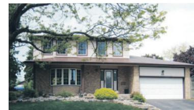
SPACIOUS FAMILY HOME $460,000