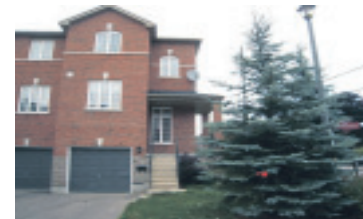
LOVELY END UNIT TOWNHOME $269,900