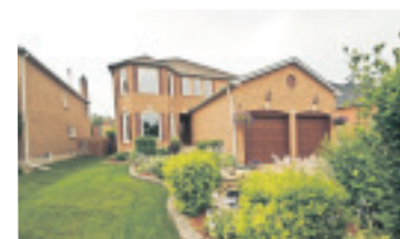
PROF FIN BSMT ON POPULAR STREET $529,800