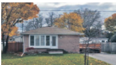
RENOVATED 3+1 BRICK BUNGALOW $339,500