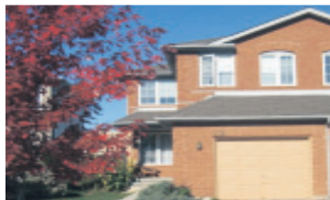
4 BDRM/3 BATH - 1660 SQ FT SEMI $354,900