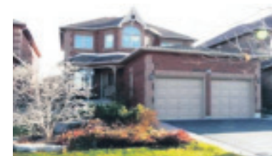
WELL MAINTAINED W/INGROUND POOL $469,900