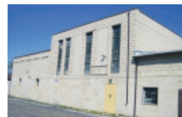
INDUSTRIAL UNIT IN HEART OF GEORGETOWN

David Burland*/Nusha Mathieson* 10-168-30 W1941176