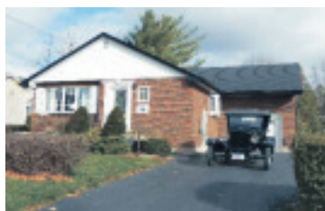
BRILLIANT LOCATION - VIEW OF LAKE $319,000