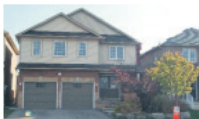
WALKING DISTANCE TO SCHOOLS, PARKS $344,900