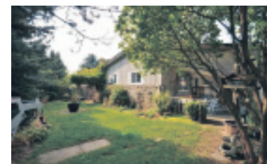
A VERY UNIQUE PROPERTY! $599,900