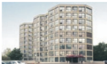
1600 SQ FT - SPECTACULAR PARK VIEWS $269,900