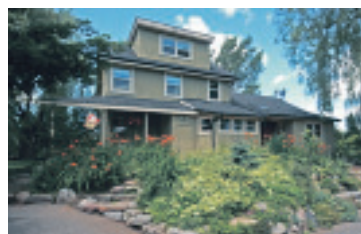
BRIGHT AND FULL OF CHARACTER $399,000