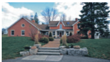
COUNTRY ESTATE WITH 2 PARCELS $3,195,000