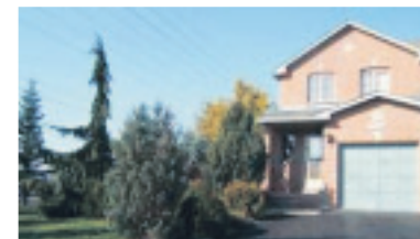
GORGEOUS SEMI-FABULOUS LOT $349,000