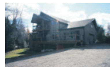
BRAND NEW HOME ON 4.5 ACRES $785,000