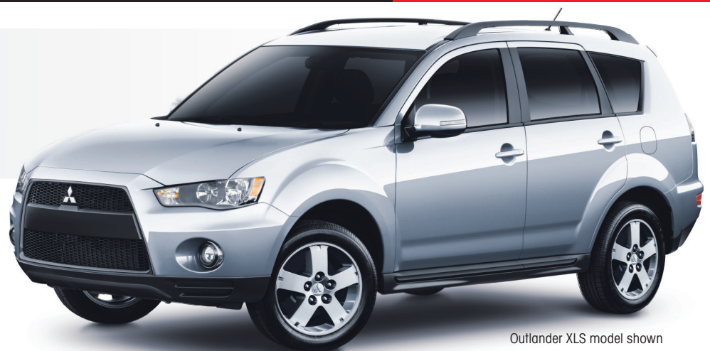
Outlander XLS model shown

10 YEAR 160,000 km POWERTRAIN LTD WARRANTY BEST BACKED CARS IN THE WORLD*