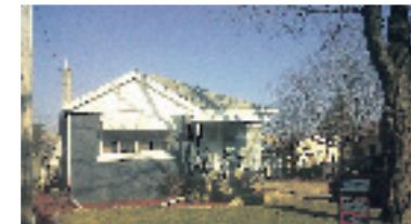
LEGAL 3+2 BDRM DUPLEX $328,500 Chris* & Lee Gonchar* New Exclusive