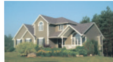
FABULOUS 4 BDRM ABUTTING CONSERVATION $669,900 Jill Johnson* New Exclusive