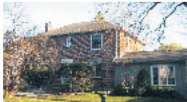
FIRST TIME OFFERED IN 40 YEARS-DOUBLE LOT $489,900 Jill Johnson* New Exclusive