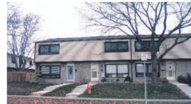
3 BEDROOM WITH FINISHED BASEMENT $219,900 PresswoodTeam.com 10-448-30 W1989608