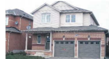
FAMILY HOME - MOUNT PLEASANT VILLAGE $399,900 PresswoodTeam.com 10-445-19 W1988990