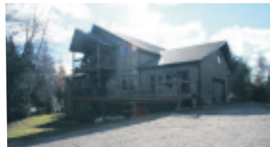
INCREDIBLE NEW HOME ON 4.8 ACRES $785,000 Kathy Ellis* New Exclusive