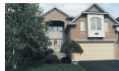
50 Chester Crescent, Georgetown Sunday, November 7, 2:00-4:00 $495,000