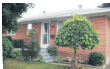
16 Sarah Street, Georgetown Saturday, November 6, 2:00-4:00 $306,888