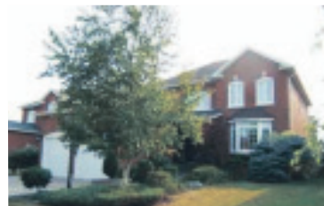
41 Samuel Crescent, Georgetown Sunday, November 7, 2:00-4:00 $609,000