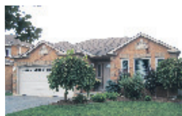
85 Birchway Place, Acton Saturday, November 6, 2:00-4:00 $419,000