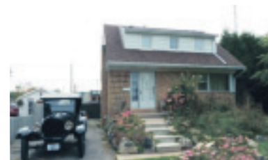
30 Meadvale Road, Acton Sunday, November 7, 2:00-4:00 $279,000

Thom Gallagher*/Ryan Green* 10-418-99 W976698