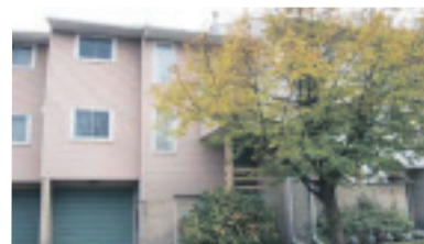
6 Lynden Circle, Georgetown Sunday, November 7, 2:00-4:00 $259,900

Full listing details available at: www.johnsonassociates.ca