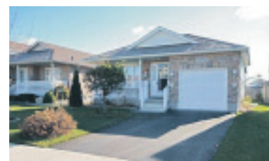
163 Milligan Street, Fergus Sunday, November 7, 2:00-4:00 $262,200