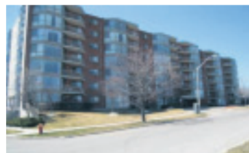
26 Hall Road, Unit 501, Georgetown Sunday, November 7, 2:00-4:00 $210,000

Chris* & Lee Gonchar* 10-331-30 W1941203