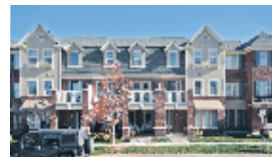
655 Holly Avenue, Milton Sat, Nov.6 & Sun, Nov.7, 2:00-4:00 $345,777