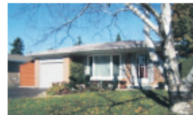
30 Greystone Crescent, Georgetown Sunday, November 7, 2:00-4:00 $399,900