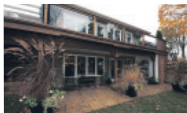
47 Dawson Crescent, Georgetown Sunday, November 7, 2:00-4:00 $697,500