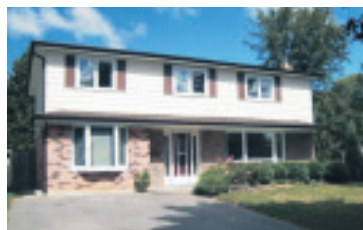
35 Faludon Drive, Georgetown Sunday, November 7, 2:00-4:00 $425,000