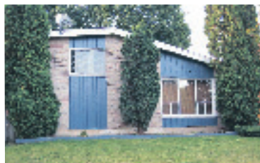
53 Weber Drive, Georgetown Sunday, November 7, 2:00-4:00 $339,900