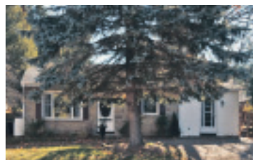
729 Bush Street, Caledon Sunday, November 7, 1:00-3:00 $239,900