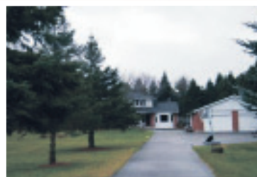
PEACEFUL DREAMING $475,000