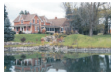
COUNTRY ESTATE WITH 2 PARCELS $3,195,000

Johnson Associates Open House Tour Plan your weekend – when and where to attend the most desirable open houses: www.johnsonassociates.ca