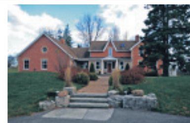
COUNTRY PROPERTY CLOSE TO TORONTO $2,745,000