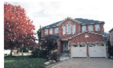
34 Gollop Crescent, Georgetown Sat, Nov.6 & Sun, Nov.7, 2:00-4:00 $699,900