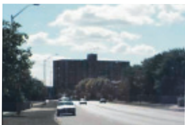
GORGEOUS CONDO - MISSISSAUGA $198,800