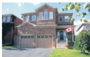
10 Chaplin Crescent, Georgetown Saturday, November 6, 2:00-4:00 $564,900