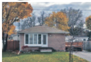
RENOVATED 3+1 BRICK BUNGALOW $339,500

Barry Cordingley*/Valerie Keslick* 10-438-99 W1985912