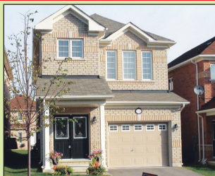
100 MEADOWLARK DRIVE $459,900

Get the Most Experience Working For You.