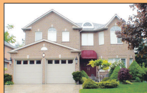
RAVINE BACKDROP RIGHT OUT OF A MAGAZINE ON AN "IT" STREET IN G'TOWN SOUTH $849,900

Get the Most Experience Working For You.