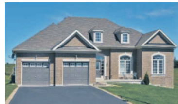
2300+ SQ FT BUNGALOW WITH VIEWS $554,900