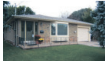
PARK LIKE SETTING ON QUIET COURT $404,500