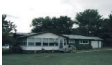
3 BEDROOM COTTAGE ON SEAGULL LAKE $294,900

PresswoodTeam.com 09-164-3009-277-30 W1862054/W1887467