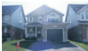
GORGEOUS 3 BEDROOM BEAUTY $289,900

Barry Cordingley*/Valerie Keslick* 10-220-99 X1875819