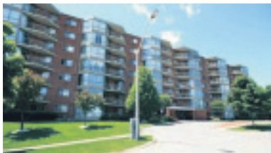
ONE BEDROOM OPEN CONCEPT $210,000