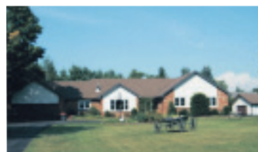
4 BEDROOM BUNGALOW & 30x40 FT. SHOP $629,900