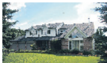
POULTRY FARM/FAMILY ESTATE $995,000