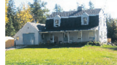
3 BEDROOM CAPE COD ON LARGE PROPERTY $418,888