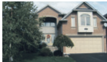
PERFECT HOME ON POPULAR STREET $495,000