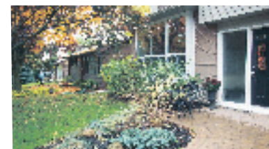
SPACIOUS 3 LEVEL SIDESPLIT $425,000