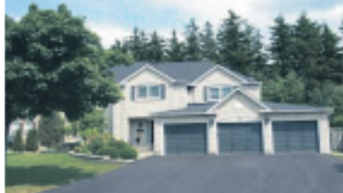
RICHMOND HILL EXECUTIVE 5 BDRM $759,900