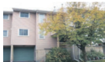
SPACIOUS TOWNHOME IN GREAT AREA! $259,900