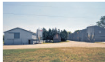
SUPERB INCOME PROPERTY $1,145,000