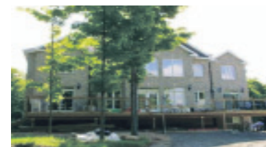
BEAUTIFUL 2 STOREY OPEN CONCEPT $399,000