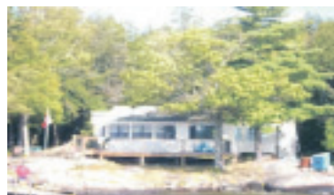
3 BEDROOM COTTAGE WITH WATER ACCESS $174,900