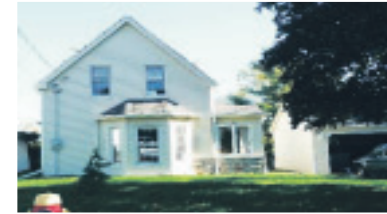
FANTASTIC OLDER HOME ALL MODERNIZED $619,000