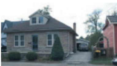
CENTURY HOME BACKING ONTO THE CREDIT $589,000