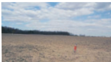
SUPERB LOCATION ON PAVED ROAD $269,000