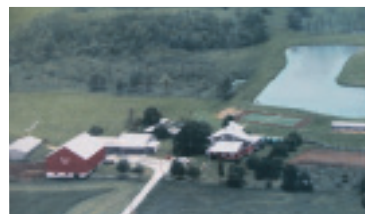
BEAUTIFUL - PRIVATE 103 ACRE FARM $959,000