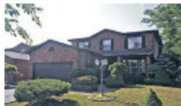
4+1 BEDROOM BEAUTY $473,900

Mary Maan*/Emma Fedor* 10-310-30 W1931058