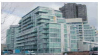
GRENADIER LANDING-TORONTO $1,500/Month