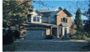
SUPERB HOME ON GOLF COURSE LOT $975,000