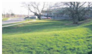
COMMERCIAL LAND ON HIGHWAY #7 & #25 $95,000