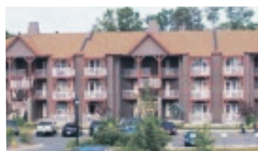
MULTI-SEASON RETREAT! $9,000