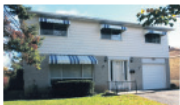
"RETREAT" STYLE BACKYARD $369,900