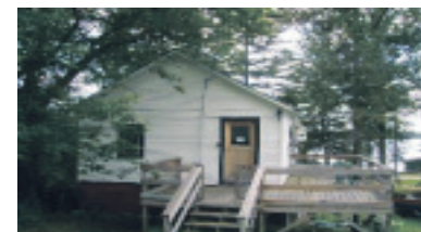
2 BEDROOM COTTAGE W/VIEWS OF LAKE $49,000

Mary Maan*/Emma Fedor* 10-310-30 W1931058