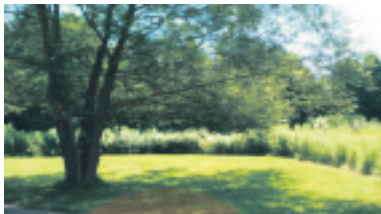
ERIN BUILDING LOT $174,900