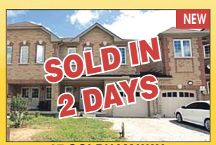
27 GOLDHAM WAY, GEORGETOWN