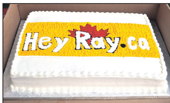
Everyone enjoyed a sweet treat from Hey Ray.