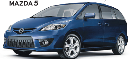
GT model shown