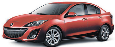
GT model shown