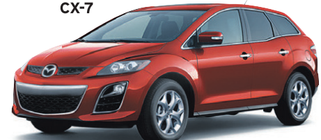
GT model shown