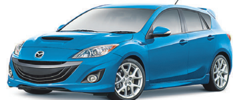
GT model shown