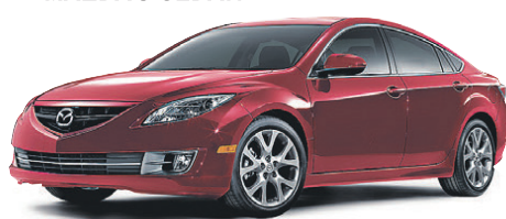
GT-V6 model shown