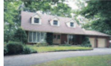
BACKS ONTO THE CREDIT! $549,900 PresswoodTeam.com 10-329-30 W1940252