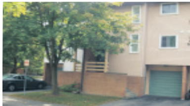
NEW, NEW, NEW - TOTALLY UPGRADED $269,900 PresswoodTeam.com 10-364-30 W1953525

Listing details available at: www.johnsonassociates.ca