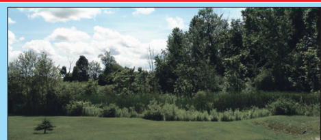
GORGEOUS 1.26 ACRE BUILDING LOT $224,900

SOLD Get the Most Experience Working For You.