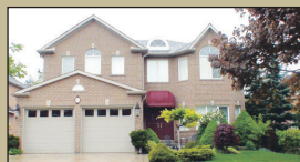
RAVINE BACKDROP RIGHT OUT OF A MAGAZINE ON AN "IT" STREET IN G'TOWN SOUTH $849,900

Beautifully maintained show-piece home with a whopping 3600 square feet plus a walkout basement awaiting your ideas. Gorgeous patterned concrete balcony and patio plus concrete ballisters and handrails that have a grandiose Tuscan feel - and a wrought iron circular staircase to boot! Professionally landscaped with a concrete driveway that sets this house apart with its amazing curb appeal. Pride of ownership inside and out...plaster crown mouldings, custom trim and baseboards, '9' ceilings on main floor, french doors, hardwood floors and stylish ceramics throughout, California shutters, solid staircase. Excellent layout on every floor with amazing square rooms! Professionally painted top to bottom, master bedroom retreat with a 5Pc bathroom out of Trump Tower that you have to see!