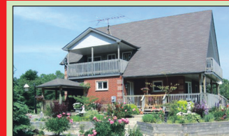
WELCOME HOME TO THIS PARK-LIKE 2.74 ACRES $699,900

As Thanksgiving Day approaches, Our blessings we recall; The thing we are most thankful for, We recollect them all. You are really special, In all you say and do. You've made a difference in our lives; We're thankful now for you..