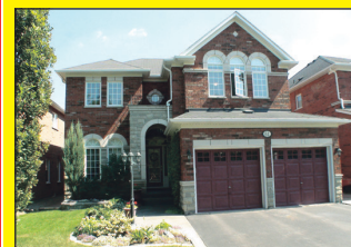
PRESTIGIOUS STEWART'S MILL WITH KILLER BASEMENT $609,900

granite countertops, mouldings top and bottom, pot lights, additional pantry space, garden door walkout to large backyard, the list goes on and on. Main floor laundry and excellent use of space both on the main floor and also on the 2nd floor with 4 bedrooms and 2 full washrooms! A pocket of 50 homes in growing area right off the 401 (2 mins). Just finished, never lived in. Call quick before it's gone.