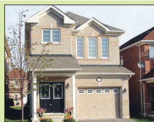
100 MEADOWLARK DRIVE $459,900

JUST SOLD Get the Most Experience Working For You.