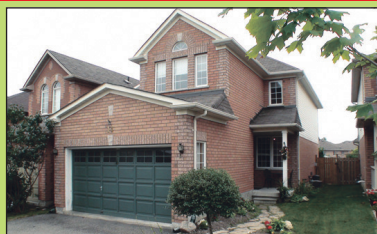
14 RUSSELL STREET $385,900

Stunning, all brick, custom home featuring a modern open concept design & a unique blend of elegance & country charm. Beautifully decorated & recently improved with richly stained walnut floors, ceramics & lovely new trim & baseboards. Impressive great room with floor-to-cathedral ceiling brick fireplace. Full 1 bdrm inlaw suite beautifully done with games room, living room with stone fireplace and lots of pot lights. Detached dbl car garage plus a fantastic workshop (30'x55') with heat, hydro, water, 14' ceiling, 2 truck doors & mezzanine. Great location - just 20 min. to Georgetown GO. Call for full details.