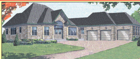
LUXURY BUNGALOW ON 10 ACRE WOODED LOT $888,000

2800 sq. ft. with oversized triple car garage plus 1/2 garage for tractor storage etc. Cathedral ceiling in family room, '9' ceilings on main floor & walkout basement with 2 separate entrances into basement, solid maple or oak kitchen cabinets & bathroom vanities, granite countertops, and a lot more. Select all your perfect colours and move in to your dream home this summer.