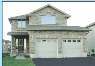
MOVE A LITTLE WEST AND LOOK WHAT YOU CAN GET! $324,900

JUST SOLD Get the Most Experience Working For You.