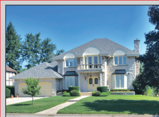
BUILT LIKE FORT KNOX, A STANDOUT HOME! $974,900

practical layout with 2 bedrooms up, and 1 on main floor plus finished rec room for added living space. Eat-in kitchen made for the whole family, amazingly spacious and lovingly renovated featuring large centre island with breakfast bar, and walkout to entertainer's deck and backyard. All the major stuff done...roof, windows, furnace, baseboards, moulding, fencing, garden shed, etc. Call us to set up your viewing.