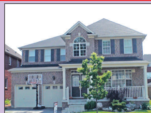
BLISSFULLY BRIGHT AND MAGNIFICENT - LARGE FAMILY HOME $699,900

2800 sq. ft. with oversized triple car garage plus 1/2 garage for tractor storage etc. Cathedral ceiling in family room, '9' ceilings on main floor & walkout basement with 2 separate entrances into basement, solid maple or oak kitchen cabinets & bathroom vanities, granite countertops, and a lot more. Select all your perfect colours and move in to your dream home this summer.