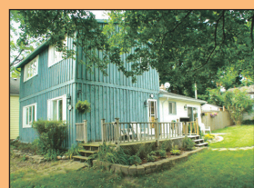
CHARMING CENTURY HOME WITH ALL THE FIXINS! $329,900

SOLD Get the Most Experience Working For You.