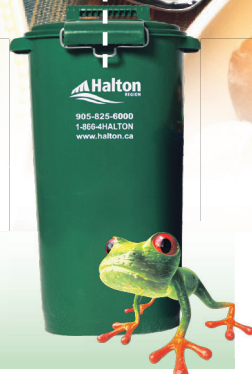
Items for GreenCart