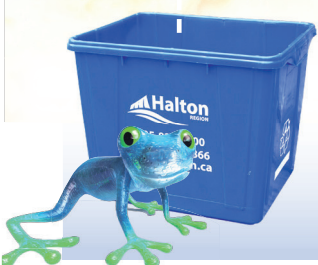
Items for Blue Box