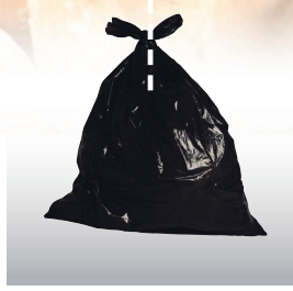
Items for Garbage