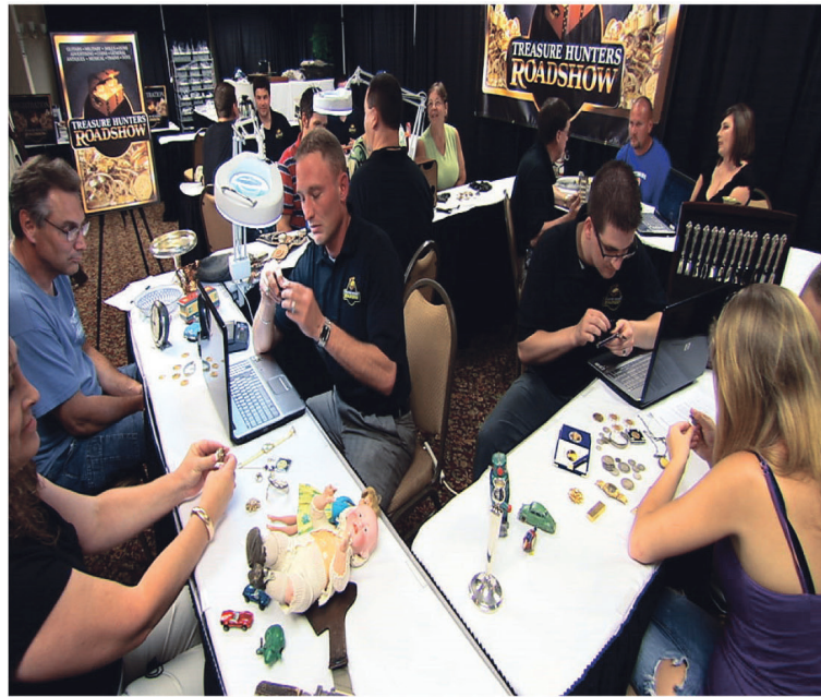
Above • These guests cashed in large bags of broken and unwanted gold and jewelry at a previous show.