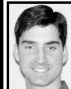
By Cory Soal R.H.A.D.

(Across from the Library and Cultural Centre)