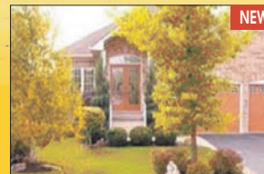
LOVELY DETACHED HOME

as low as 1% TOTAL Commission 1% Total Commission Plan includes: Newspaper Advertising, Internet Advertising, Feedback, MLS, etc.