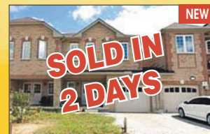
27 GOLDHAM WAY, GEORGETOWN

* Choose the "Corporate Teams" 1% Total Commission plan and receive MLS, Newspaper & Internet Advertising, Professional Photographs, Feature Sheets, Viewings Arranged, Weekly Feedback, Open House & Yard Sign! (where applicable). Sellers can also choose a plan involving Maximum 3.5% Total Commission with up to 2.5% commission paid to the brokerage representing the Buyer(s) (which could include Home@Ease Realty Inc.)