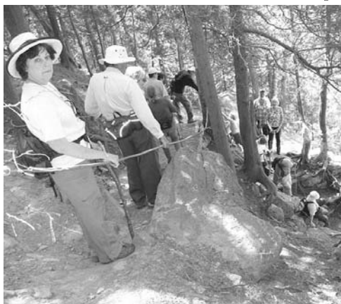
Local Bruce Trail Club members hike Devil's Pulpit in Caledon. The group hosts weekly hikes at various locations in the Halton Hills area.

There will be two short hikes in the Conservation Area, one at 1:30 p.m. specially for children, and another at 3 p.m. There will be displays, information on