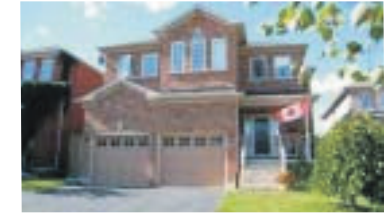
SUPERB STREET IN GEORGETOWN SOUTH $579,900