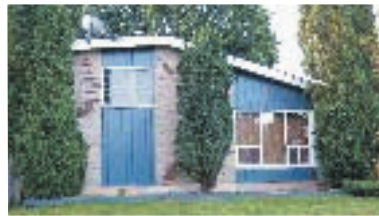
BACKS ONTO PARK $353,000