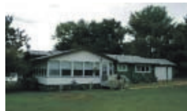
WATERFRONT HOME/COTTAGE-SEAGULL LAKE $294,900