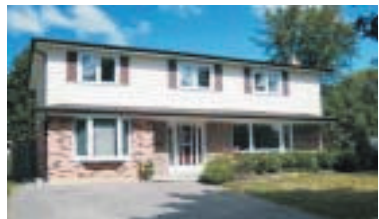
LARGE FAMILY HOME WITH SEPARATE SUITE $425,000