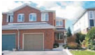
4 BDRM'S, 3 WASHROOMS, PROF FIN BSMNT $357,900