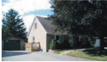
CUTE 3 BDRM-WALK TO SCHOOLS/SHOPPING $339,900