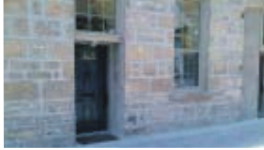
FANTASTIC 2 BDRM CONDO ON GUELPH $262,500