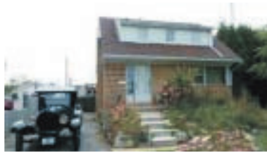
CUTE & COZY - EAST END OF ACTON $279,000