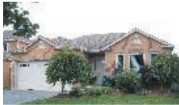
BIGGER THAN IT LOOKS-4 LEVEL BACKSPLIT $429,000