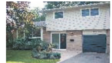
SPACIOUS 3 LEVEL SIDESPLIT $469,000