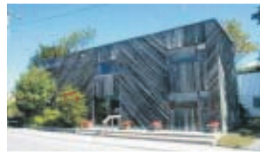
COMMERCIAL LEASE $6,500/Month