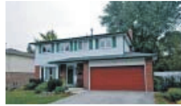
LOVELY RAVINE LOT $439,900