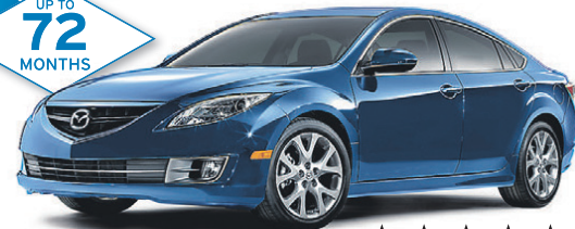
GT-V6 model shown