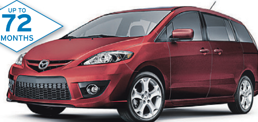
GT model shown