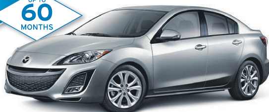
GT model shown