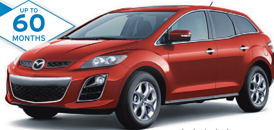
GT model shown