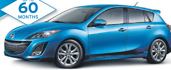
GT model shown