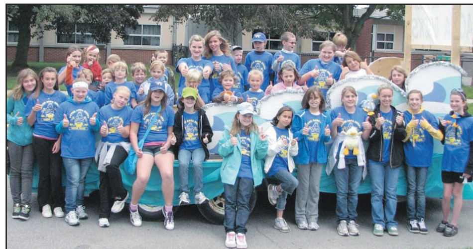
More than 40 swimmers from the Acton Aqua Ducks swim club climbed out of the water to participate in the Acton Fall Fair parade on September 18.