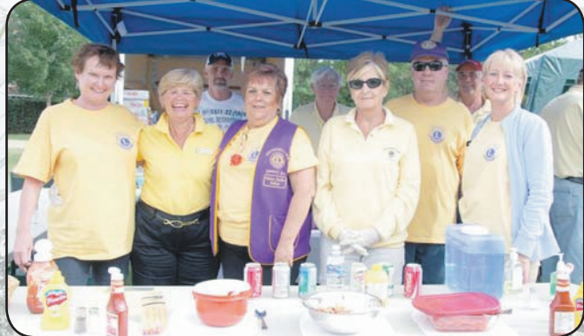
One of the most popular fair foods was back bacon on a bun from the Georgetown Lions Club.