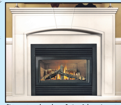
Picture not exactly as shown. Options & decorations extra.

Napoleon 33" Direct Vent Fireplace $1599 + tax installed SAVE $400 (not including promotion) OFFER EXPIRES SEPT 29/10