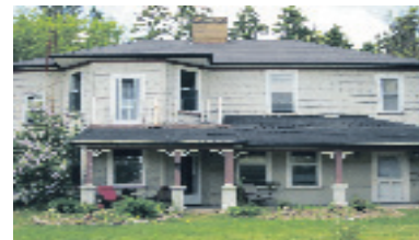
EXCELLENT OPPORTUNITY! $269,000 Elizabeth Doell* 10-199-9 X1914536