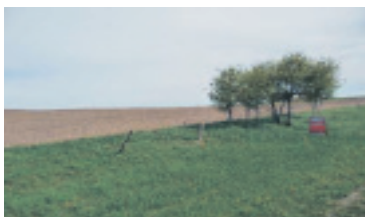
FANTASTIC VIEWS - ROLLING HILLS $169,000 Suzanne Lawrence* 10-309-VL X1930409