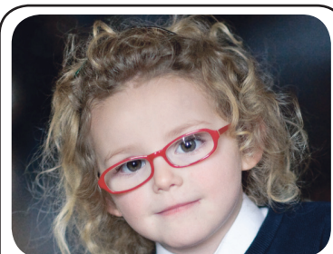
FIRST, LAST NAME starting JK, age 4 Love Mommy, Daddy, Big Bro & Sisters & Pets

To book your space, please contact Special Features 905-873-0301 or email features@independentfreepress.com