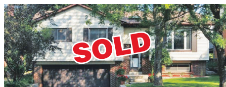
ACTON - $339,900