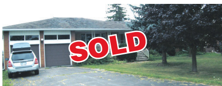
HALTON HILLS - $439,000

Thinking of Selling? Call me now and let's get you SOLD!!