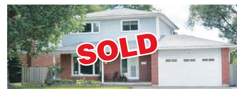
ACTON - $359,900