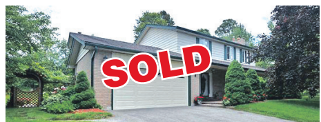
ERIN - $494,900