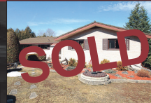
Wellington Rd. 50

More information and virtual tours at www.SusanLougheed.com