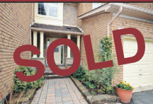
James Young Dr.

CUSTOM BUILT CHARLESTON HOME IN ERIN * 4 bdrs & 3 baths * 3/4 acre lot in estate subdivision * Extensive landscaping & interlock * Open concept main floor w/11' smooth ceilings, pot lights & hardwood * 2 fireplaces * 6 pc master ensuite w/dbl shower, whirlpool tub, 2 sinks * Lower level family room w/kitchenette, bdr, full bath & walkout is perfect for in-laws, teens or nanny * 4 season sunroom * Includes 8 appliances, hot tub, C/air & vac, reverse osmosis system, softener & air exchanger * $579,900 *