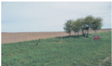
FANTASTIC VIEWS - ROLLING HILLS $169,000 Suzanne Lawrence* 10-309-VL X1930409