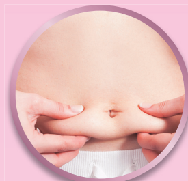
Ultra Shape V.3