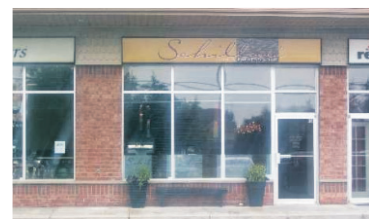
UPSCALE CAFÉ & ESPRESSO BAR $120,000 PresswoodTeam.com 10-294-30 W1918738