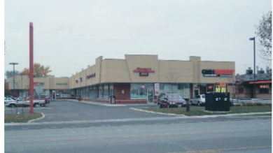
LOCATION! LOCATION! LOCATION! $24.00 SQ.FT. PresswoodTeam.com 10-238-30 W1881002