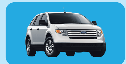
2010 & 2011 FORD EDGE

Get up to $12,339 in price adjustments for the BEST PRICE OF THE YEAR on our 2010 and 2011 lineup, inclusive!