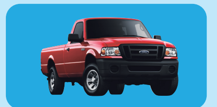
2010 & 2011 FORD RANGER