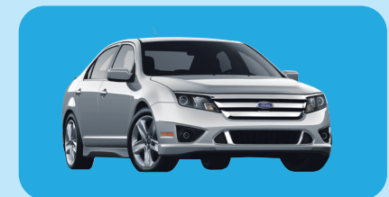
2010 & 2011 FORD FUSION