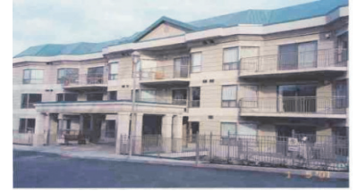
VICTORIA GARDENS PENTHOUSE $445,000