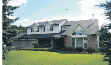
POULTRY FARM/FAMILY ESTATE $995,000