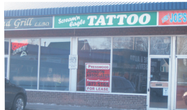
PRIME RETAIL - ON HIGHWAY 7 $15.00/SQ.FT.