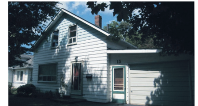
PARK LIKE BACKYARD $269,000