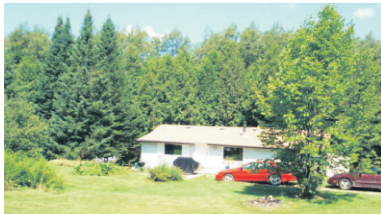
A RIVER RUNS THROUGH IT! $180,000

Anna Lostritto* 10-004-VL/10-072-VL W1894345/W1901732