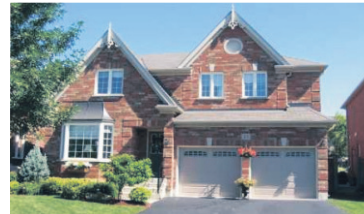
STEWART MILLS - 2600 SQ FT $549,900