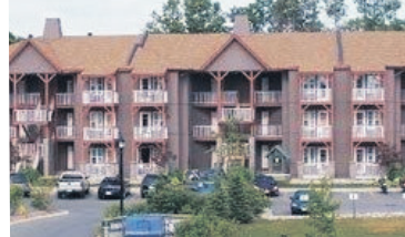
TIMESHARE IN HORSESHOE VALLEY $9,000