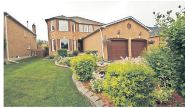
PROF. FIN BSMT + POOL ON POPULAR STREET $548,000

PresswoodTeam.com 09-164-30/09-277-30 W1862054/W1887467