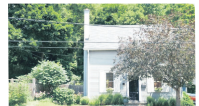
VILLAGE LIVING IN THE GLEN $399,900