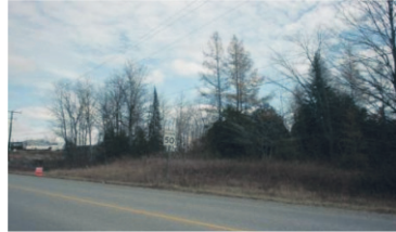
ERIN - VACANT LAND! $69,900