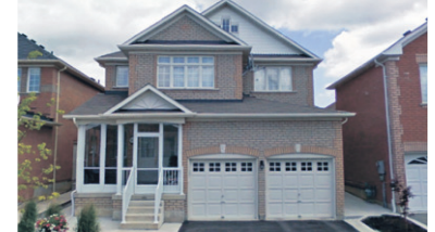
STUNNING OPEN CONCEPT W/UPGRADES $474,900