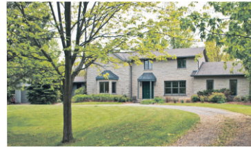
STONE HOME; PRIVATE LOCATION $1,250,000