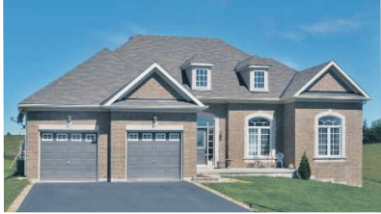
ALMOST NEW 2300+ SQ FT BUNGALOW $564,900