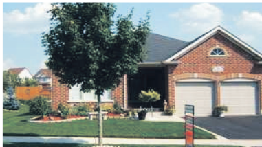
IT DOESN'T GET ANY BETTER! $499,000