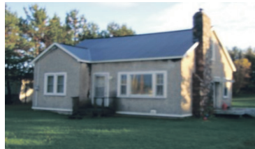
GREAT 2 BEDROOM STARTER! $94,900