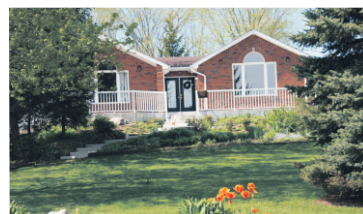
SUPERB INCOME PROPERTY $1,145,000