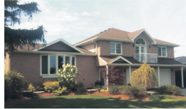
RAVINE LOT ON CUL-DE-SAC $899,900