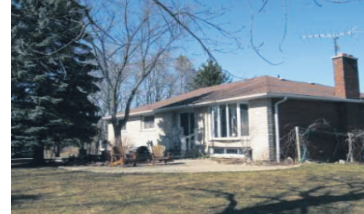
RAISED BUNGALOW ON 1.37 ACRES $549,900

Barry Cordingley*/Valerie Keslick* 10-219-30 W1921198