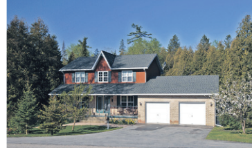
OPEN CONCEPT-FINISHED WALKOUT BSMT $434,900