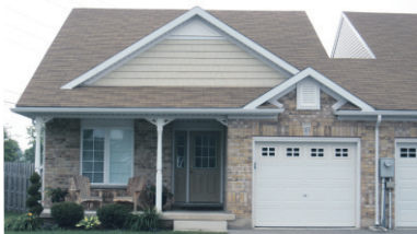
3 BR END UNIT TOWNHOME WITH LOFT! $319,900