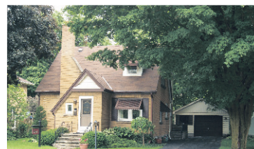
WALK TO THE GO $365,000