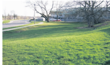
COMMERCIAL LAND ON HIGHWAY #7 & #25 $95,000