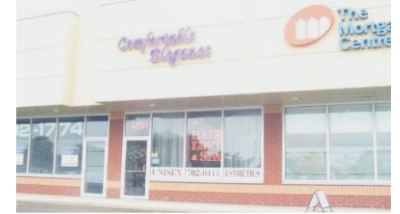
HAIR SALON/SPA FOR SALE $70,000