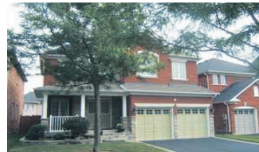
SUPERB IN STEWART'S MILL $619,000