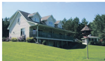
OVERLOOKING JACK'S LAKE - 5.43 ACRES $439,000