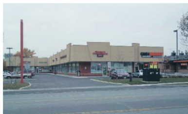
LOCATION! LOCATION! LOCATION! PresswoodTeam.com 10-238-30 W1881002