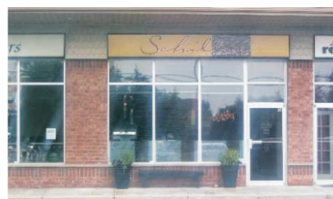
UPSCALE CAFÉ & ESPRESSO BAR $120,000 PresswoodTeam.com 10-294-30 W1918738