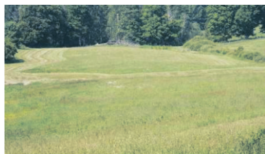
ALMOST 15 ACRES! $495,000 Kathy Ellis* 10-267-VL W1900068